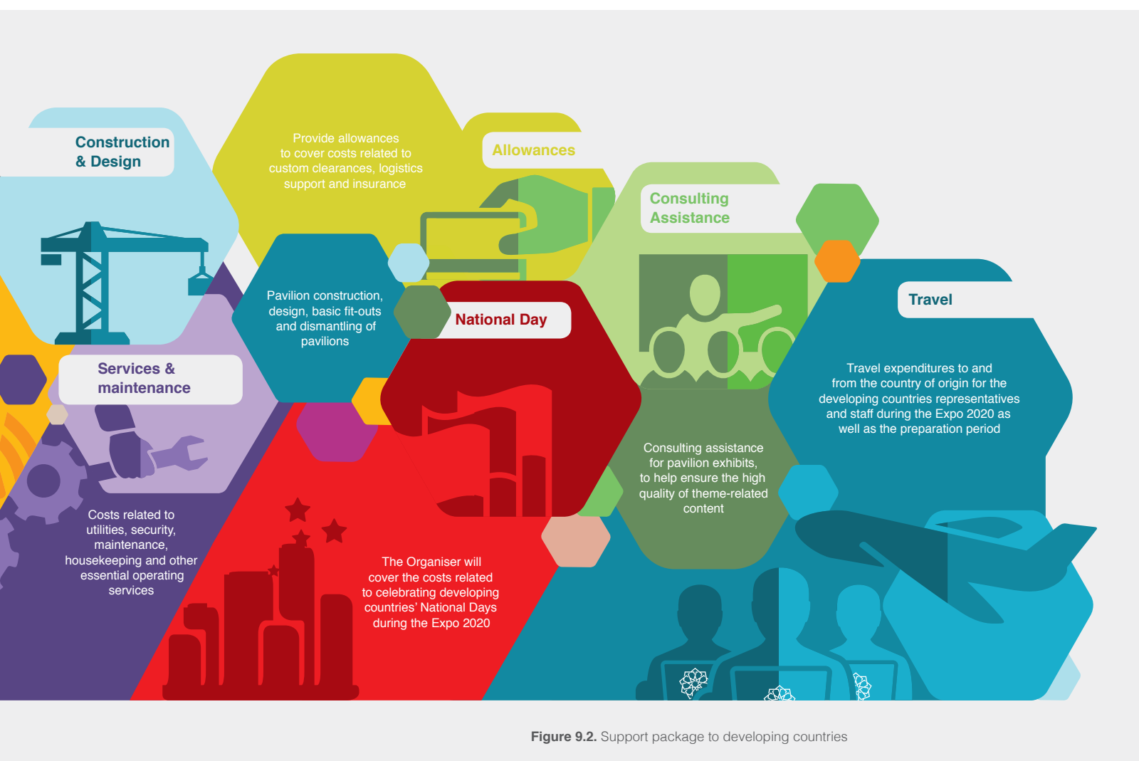
Figure 9.2. Support package to developing countries

Personnel: Organiser will cover costs related to local staff. This will include management, administrators, interpreters, hostesses and maintenance staff during the Expo 2020 as well as during the preparation period.