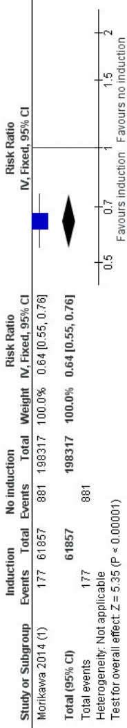
Figure 1 (Analysis 1.1)